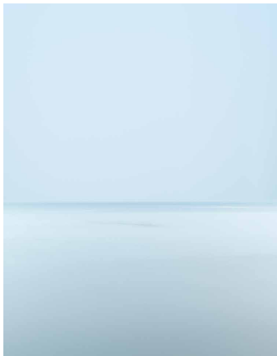
Yuk Saai Shek (Hong Kong) 2015 C-type print 195.6 x 152.4 cm (Unique edition)