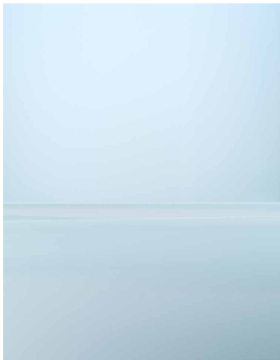
Blake Pier (Hong Kong) 2014 C-type print 195.6 x 152.4 cm (Unique edition)