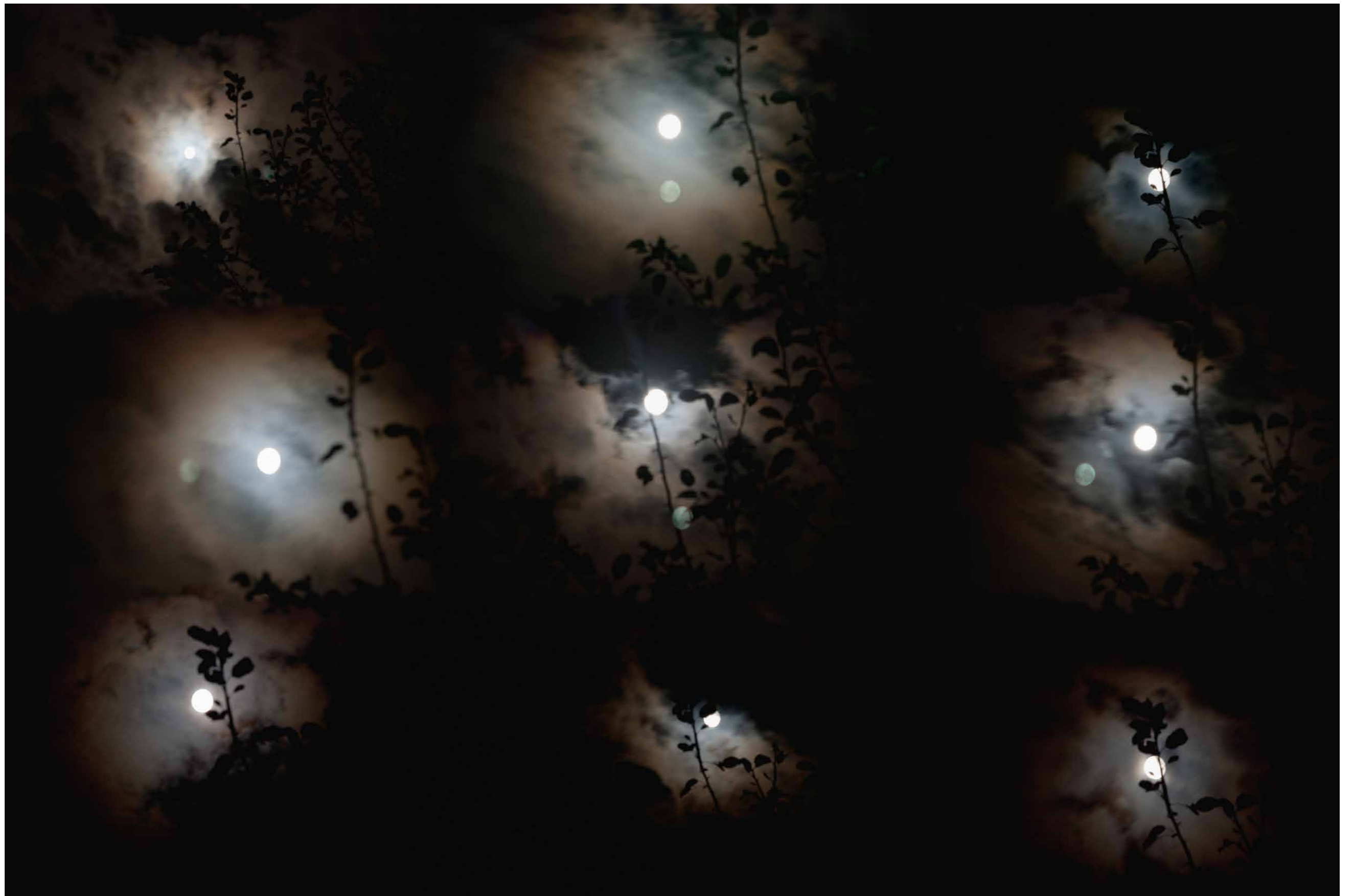
Full Moons 2015 C-print on Kodak Endura glossy paper 102 x 152 cm (Edition of 3 + 2 AP)