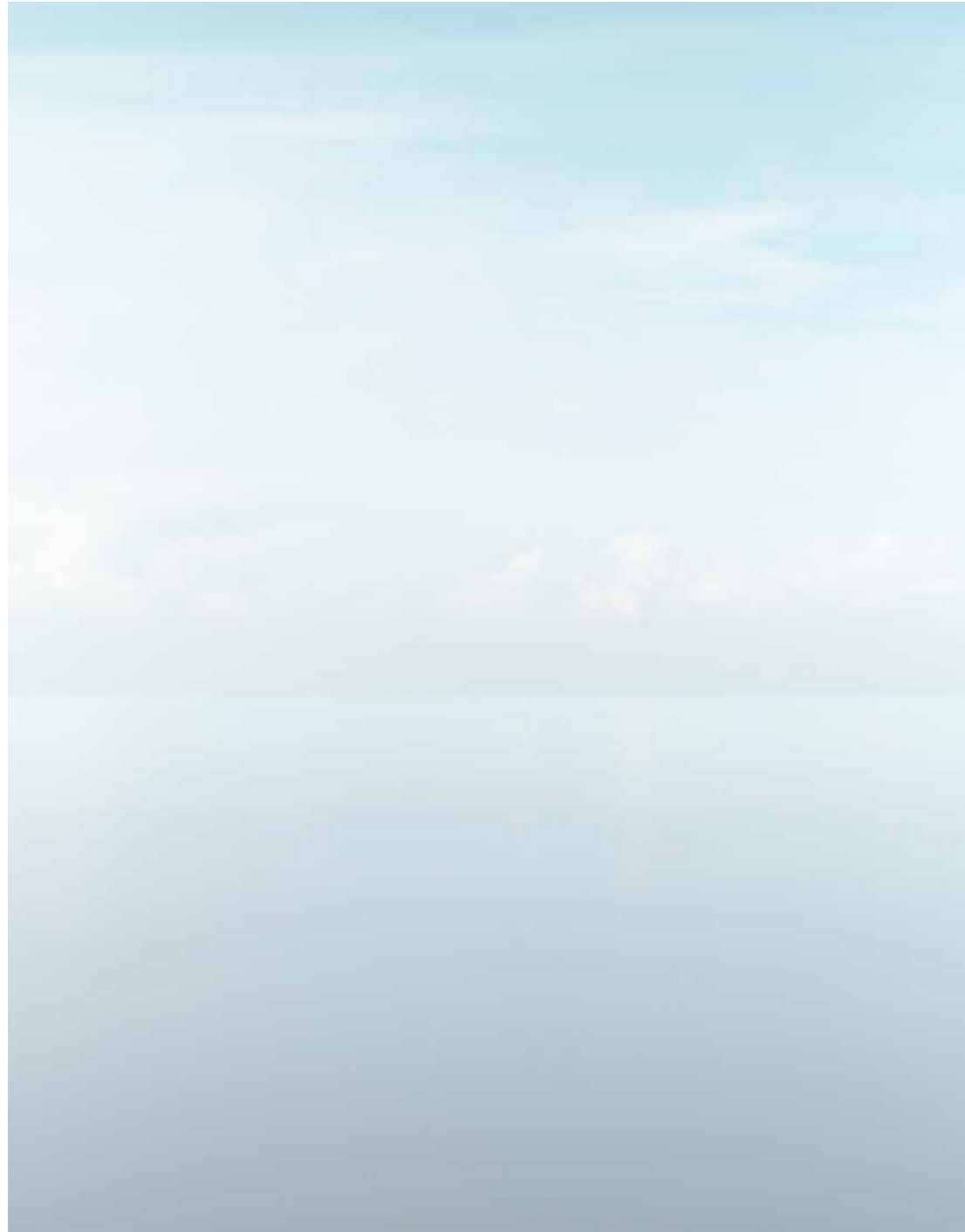
Kampung Tanjung Rhu #1 (Malaysia) 2013 C-type print 195.6 x 152.4 cm (Unique edition)