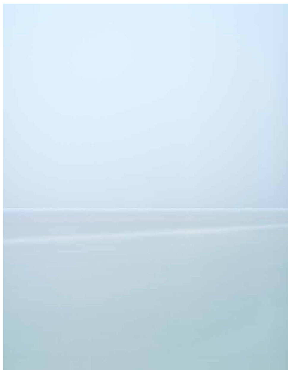
Shek Tsai Po (Hong Kong) 2015 C-type print 195.6 x 152.4 cm (Unique edition)