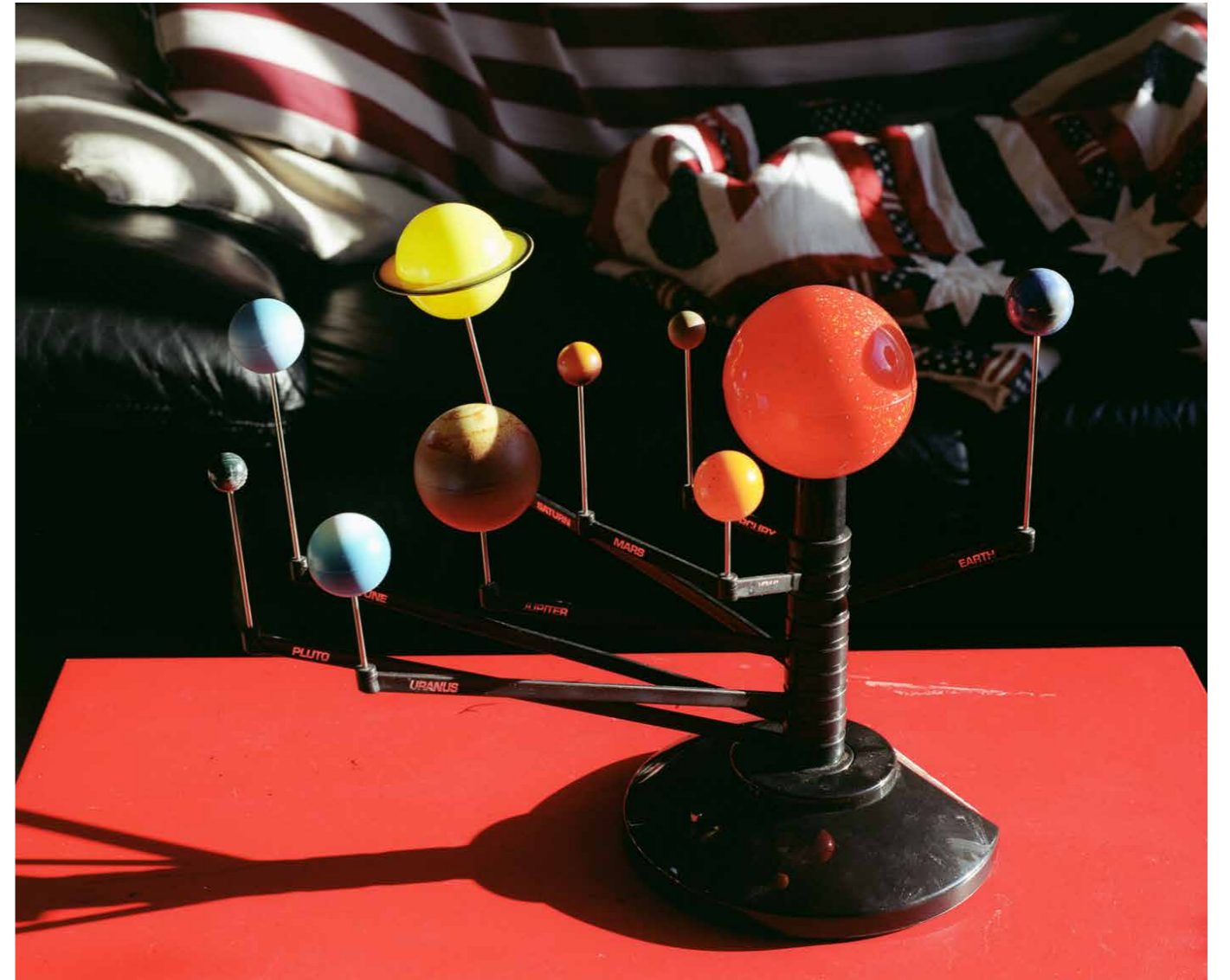
Cosmic Matter 2005 C-print on Kodak Endura glossy paper 127 x 102 cm (Edition of 3 + 2 AP)