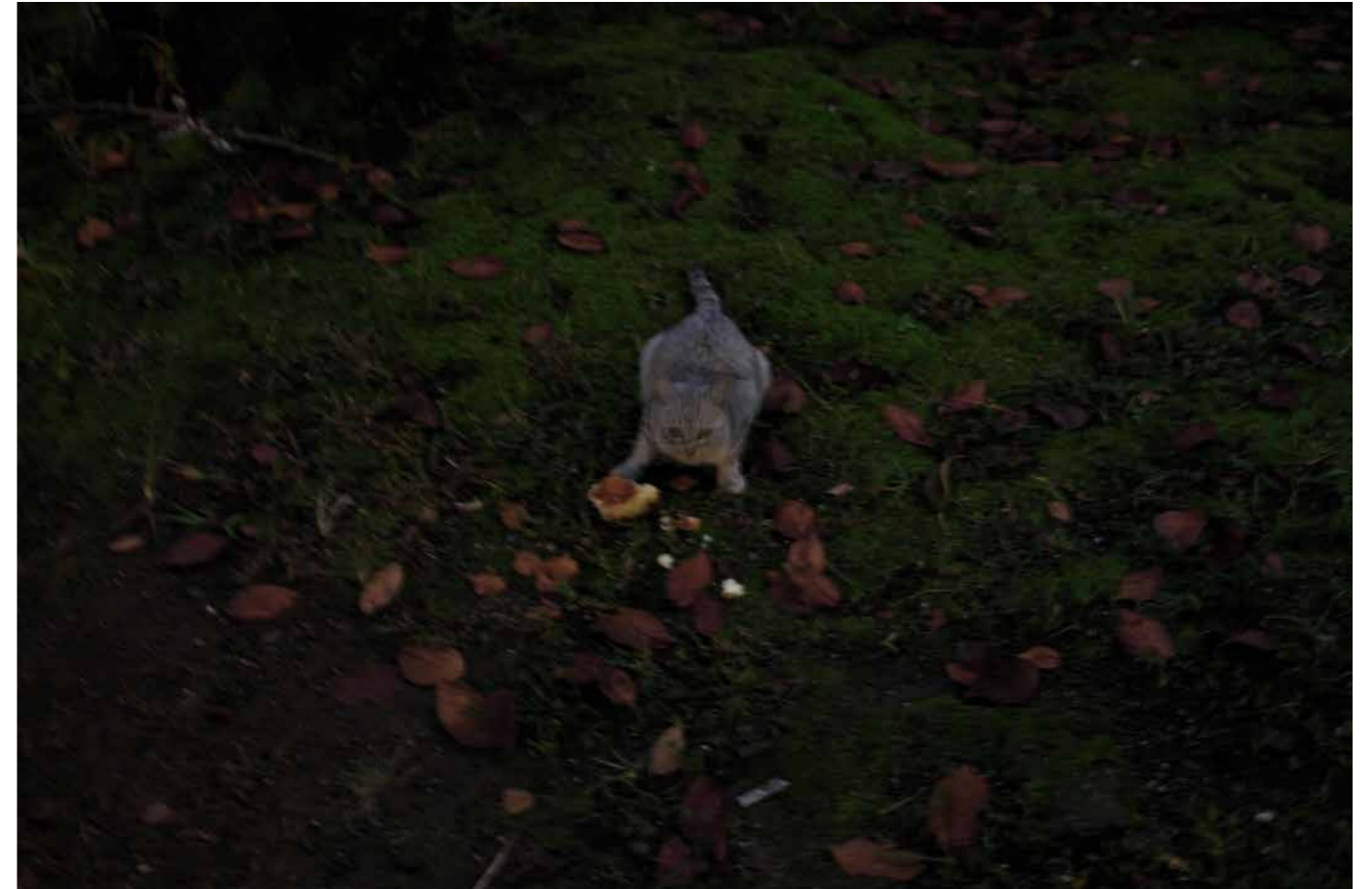
Shape Shifter 1 2014

I brush aside that thought and carry on with my reading as peacefully as possible. I wonder if I can shapeshift. It was déjà vu, all over again.