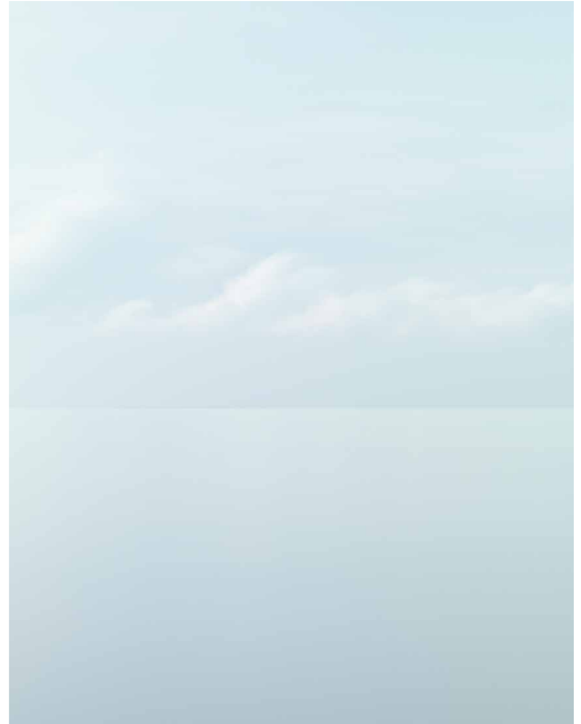
Kampung Tanjung Rhu #2 (Malaysia) 2013 C-type print 195.6 x 152.4 cm (Unique edition)