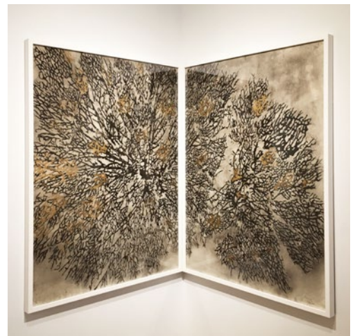
Left to right: Lionel Sabatté, 'Anis', 2016, oil on canvas, 195 x 195 cm. Image courtesy Mazel Galerie; Ahmad Sadali, 'Gunungan', 1980, mixed media on canvas, 200 x 175cm. Image courtesy Art Agenda, S.E.A.; G.R. Iranna, 'Burnt Branches', 2017, coal and gold foil on paper, 58 x 84 inches. Image courtesy Aicon Gallery.