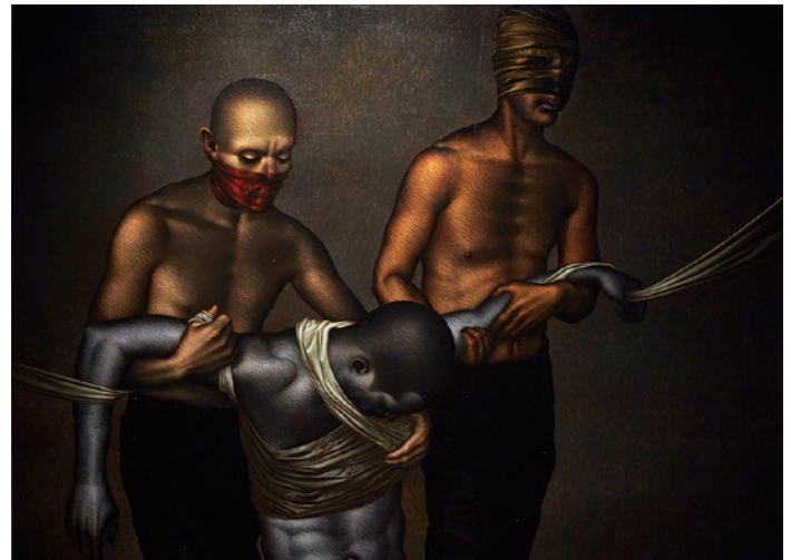
Clockwise from left: Anurendra Jegadeva, 'On the Way to the Airport', 2017, mixed media on vintage parchment in wooden box, 58.5 x 48 cm. Hiroshi Senju, 'At World's End #7', 2017, acrylic and natural pigments on Japanese mulberry paper mounted on board, 181.9 x 227.3 cm. Leslie de Chavez, 'Defeat Ushered by Surrender is the New Oblivion', 2017, oil on canvas, 195 x 247cm.