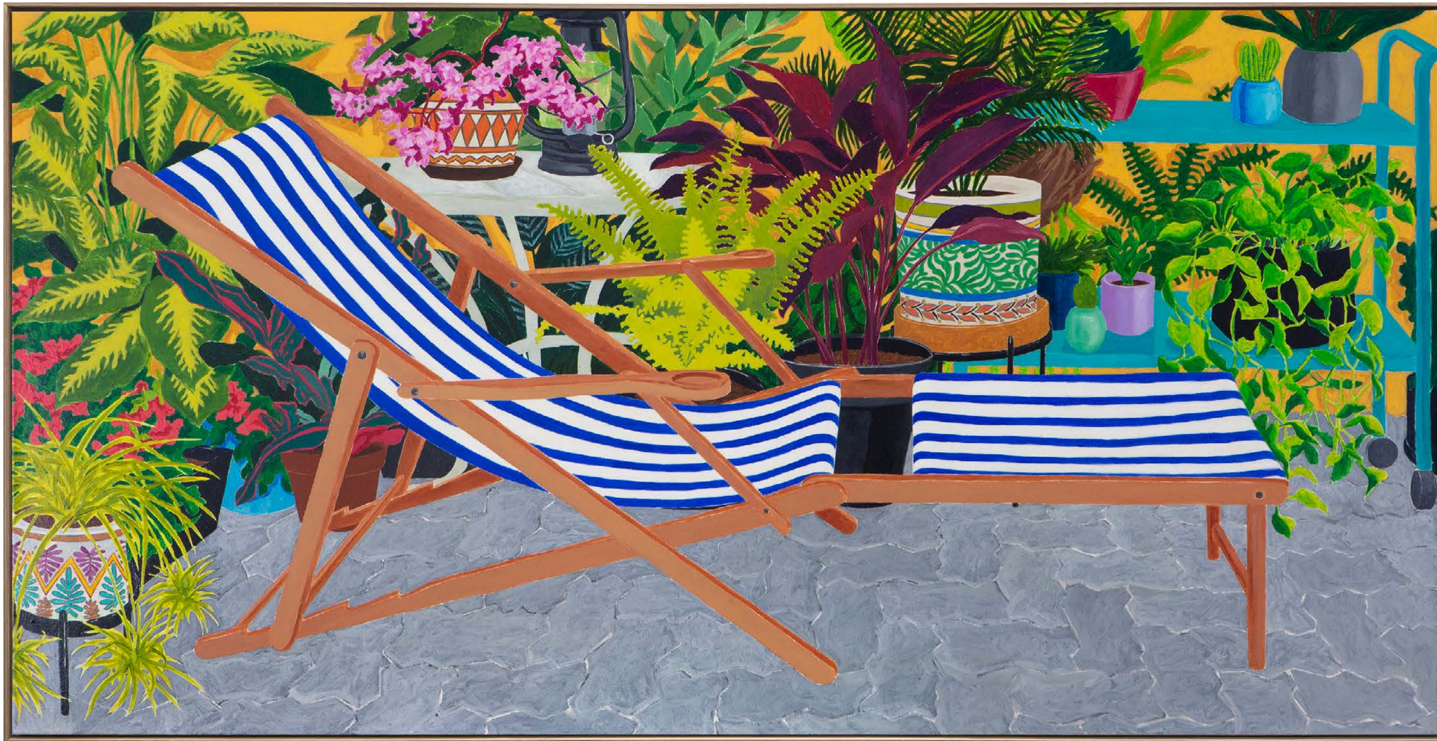
A daydream a day

2022 Acrylic on canvas 91.5 x 175 cm (work) 93.6 x 177.2 cm (framed)