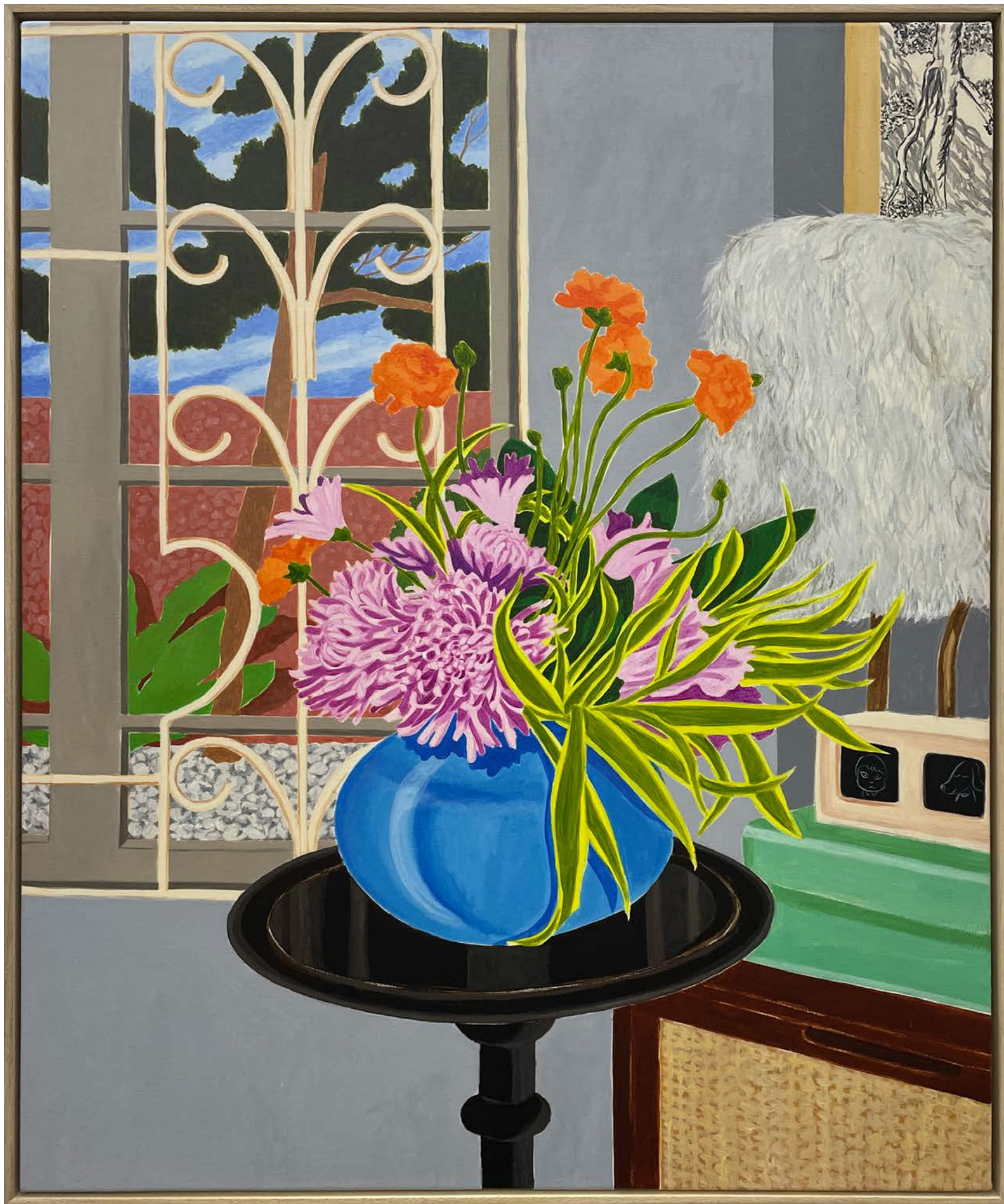
At home inside my head

2023 Acrylic on canvas 75 x 60 cm (work) 77 x 62 cm (framed)