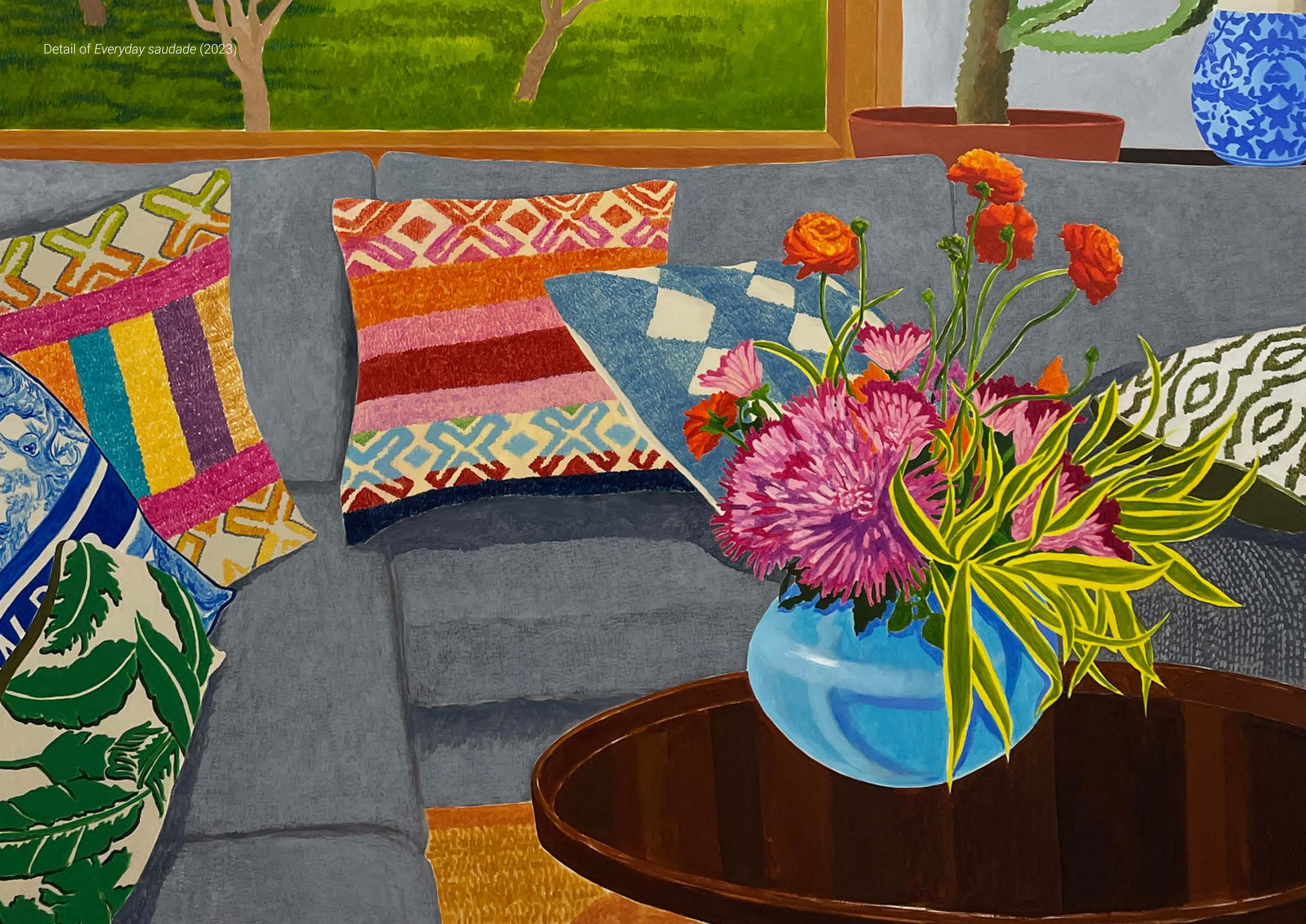
Detail of Everyday saudade (2023)