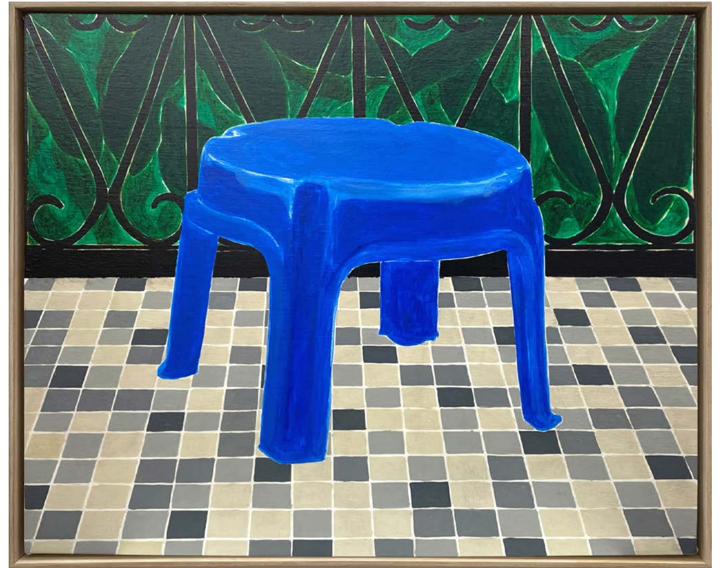
Tell me everything #2

2022 Acrylic on canvas 50 x 61 cm (work) 52 x 63.1 cm (framed)