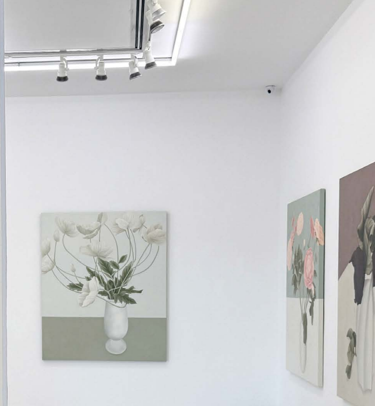
Installation view of Floral Serenity at Richard Koh Fine Art, Gillman Barracks, Singapore, 26 April - 17 May 2025.