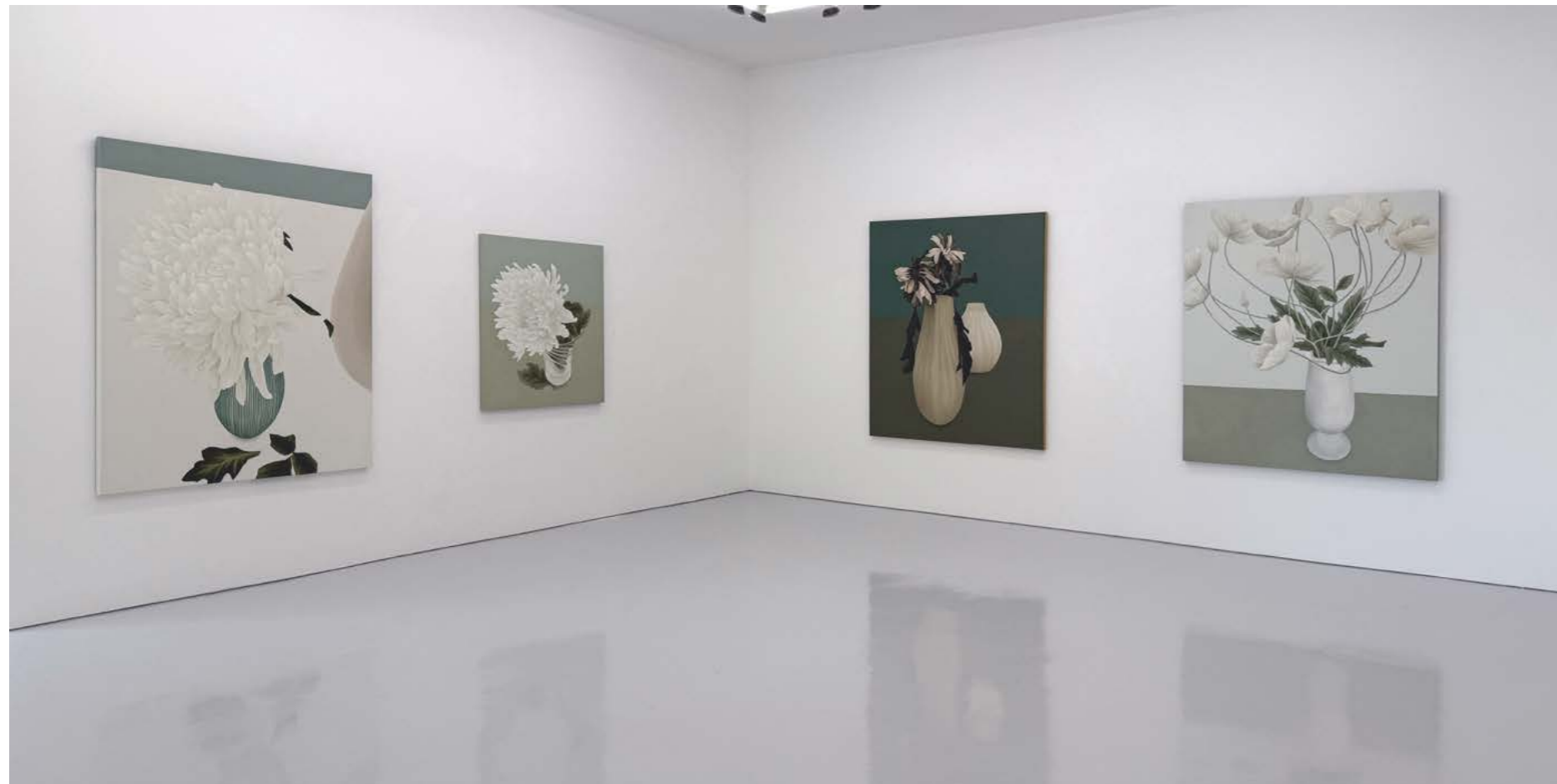
Installation view of "Floral Serenity" at Richard Koh Fine Art, Gillman Barracks, Singapore, 26 April - 17 May 2025.