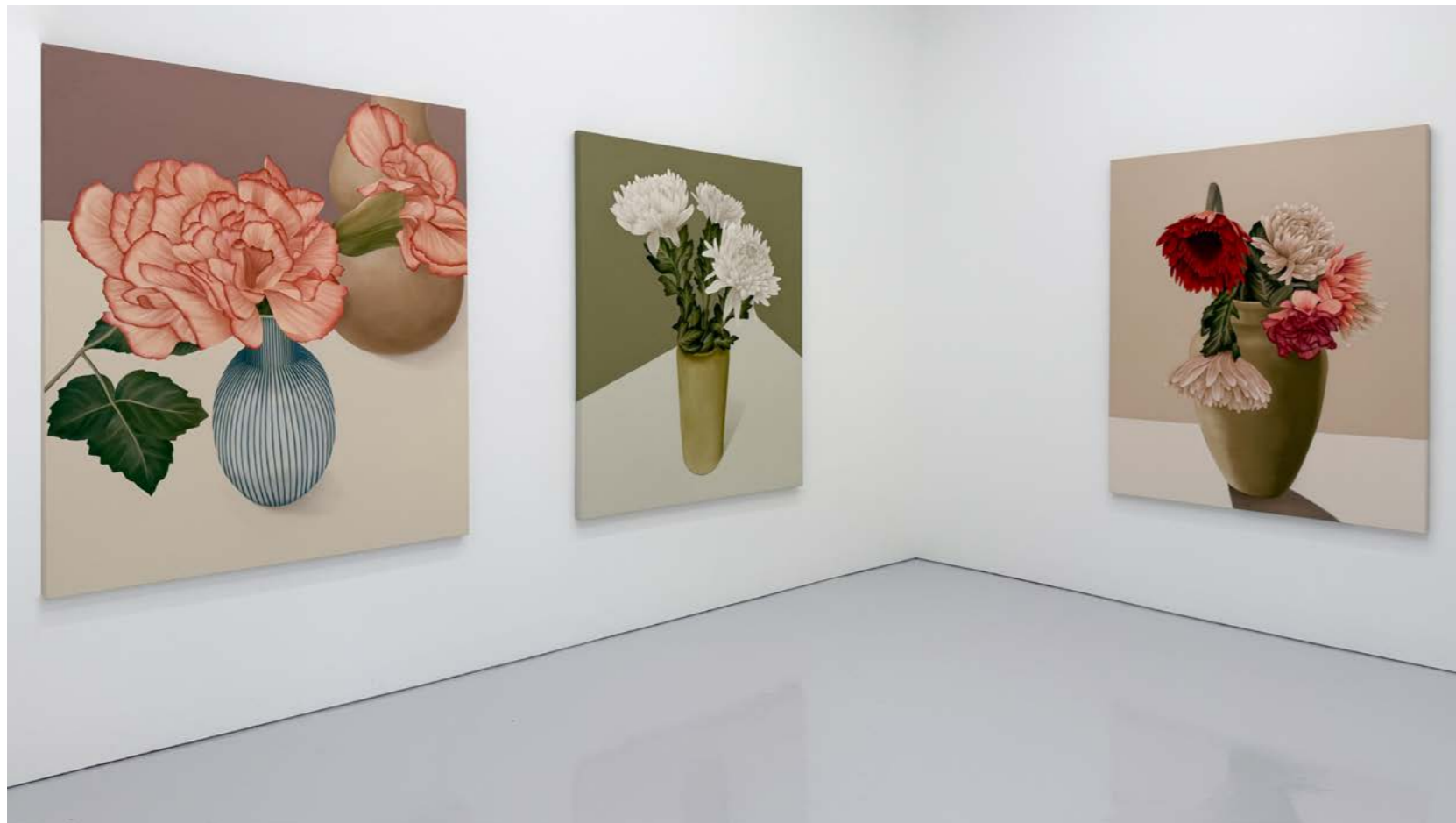
Installation view of " Floral Serenity " at Richard Koh Fine Art, Gillman Barracks, Singapore, 26 April - 17 May 2025.