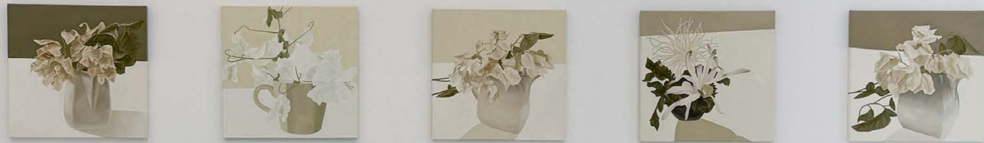
Installation view of " Floral Serenity " at Richard Koh Fine Art, Gillman Barracks, Singapore, 26 April - 17 May 2025.