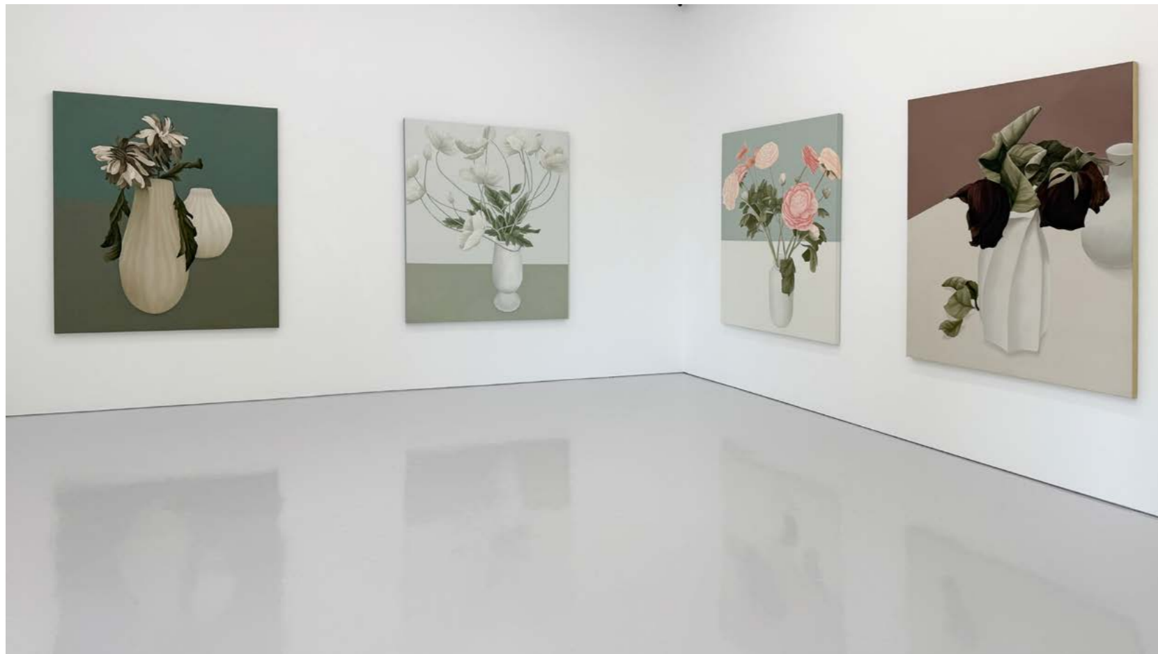
Installation view of " Floral Serenity " at Richard Koh Fine Art, Gillman Barracks, Singapore, 26 April - 17 May 2025.